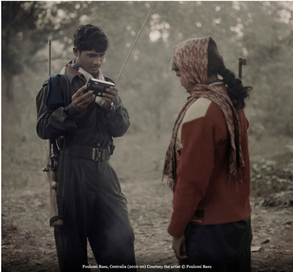
Poulomi Basu, Centralia (2010-20) Courtesy the artist © Poulomi Basu