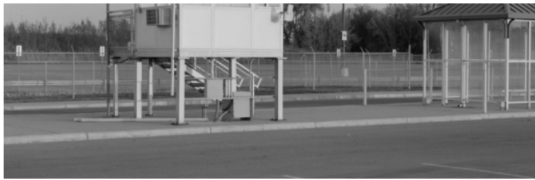
Stanley Wolukau-Wanambwa, One Wall a Web (2018)