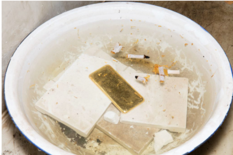
Lisa Barnard, The Canary and The Hammer (2015-19)

Originally from the United Kingdom, the artist's relocation to the US prompted a renewed perspective on the ubiquitous forms of gendered and anti-Black violence present in his new home, and manifests these considerations in the form of portraiture, landscape photography and archival imagery interwoven with fragments of poetry and writing – all the while calling to question how our learned ways of seeing and reading images may contribute to the perpetuation of systems of oppression or violence.